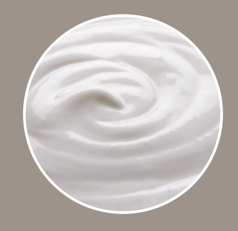
WE USE ALL NATURAL INGREDIENTS

Baked to our own unique artisan sourdough recipe for a deliciously crisp outer and a light and airy texture inside