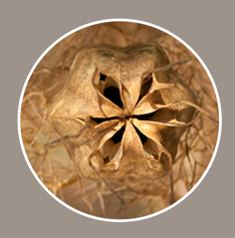
TINY SEEDS MAKE A BIG DIFFERENCE

Only the finest ingredients and natural yogurt make our premium naan very light and bubbly indeed