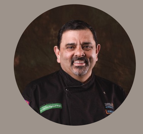
Get inspired! Watch Cyrus Todiwala OBE DBL DL...

Watch Cyrus explain the huge versatility of naan on your menus and see his inspiring ideas...it's naan, but not as you know it! Go to www.buttfoods.co.uk and visit Chef's Corner .